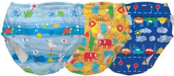
Approved Swim Diaper

Thank you for your cooperation with the enforcement of this policy and keeping our facility safe for all visitors and staff. Should you have any questions regarding these policies, please see the Pool Manager, or you may contact the Ganek Municipal Center by calling (847) 658-2716 or emailing recreation@algonquin.org .