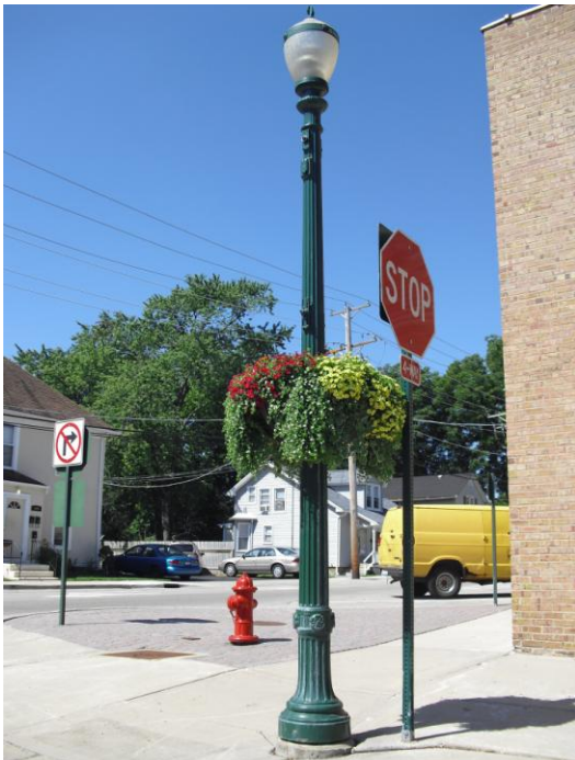
Example of decorative street fixture