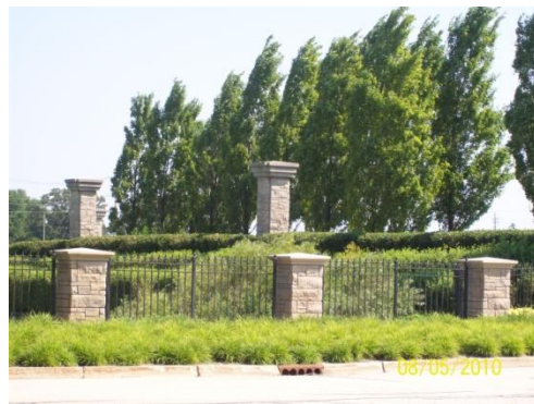
Example of entry feature elements

In the future, the Village may host a design competition for the entry feature. Once a design or several designs have been selected, a consultant would be hired to produce working drawings of the entrance feature and cost estimates. The entry feature(s) should have similar elements recognizable to Algonquin but do not all have to be identical. The entry feature should consist of the following design criteria (these criteria would be reviewed prior to launching the design competition):