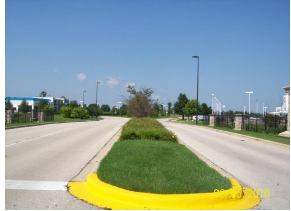
Example of landscaped median