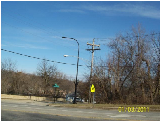
Overhead wires interfere with decorative light fixture

Unattractive items within the Village shall be removed, replaced with more attractive options, or screened as appropriate. Billboards should be removed as lease terms expire and/or as development occurs on those properties. Overhead wires should be buried underground as a condition of all new developments or as finances allow in older sections of the Village. If necessary to be installed, sound walls shall be designed to be attractive with patterns, colors or artwork on them.