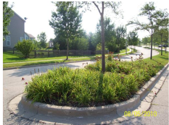
Example of landscaped median

Randall Road, Corporate Parkway, Compton Drive, Broadsmore Drive and West Algonquin Road currently have landscaped medians within the road right-of-way. The landscaping varies from grass that needs to be mowed to extensive plantings of native perennials and trees. The jurisdiction of the road, the volume and speed of traffic, and maintenance responsibilities will ultimately dictate the extent of landscaping suitable for each landscape median area. However, common landscape elements can be used to unify the areas if desired or simply having landscaped medians may be enough to recognize Algonquin as different from other areas.