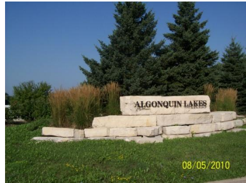
Example of entry feature elements