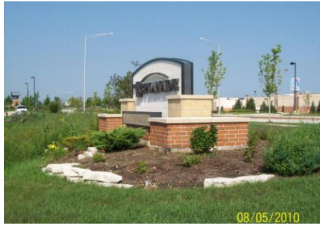
Example of entry feature elements