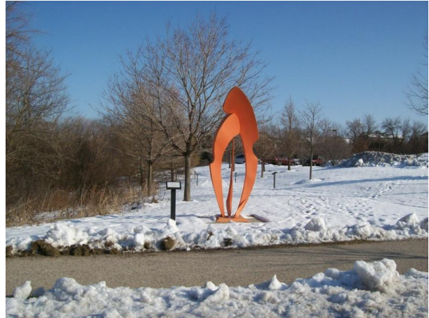
Example of outdoor public art display