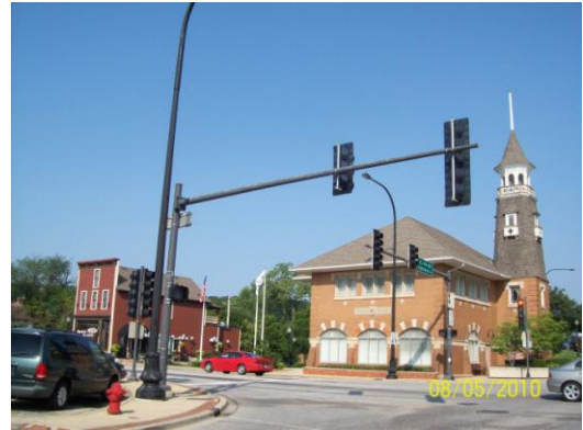
Example of painted poles and fixtures