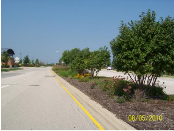
Example of landscaped median

-landscape plantings can vary based on road conditions (traffic volume, traffic speed, width of median, irrigation method, etc)