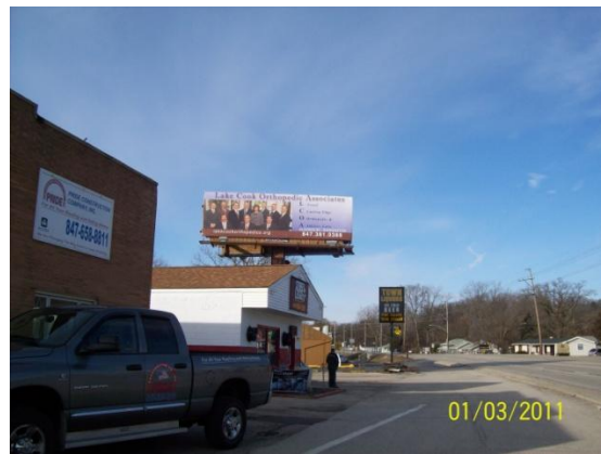
Billboards add visual blight to an area