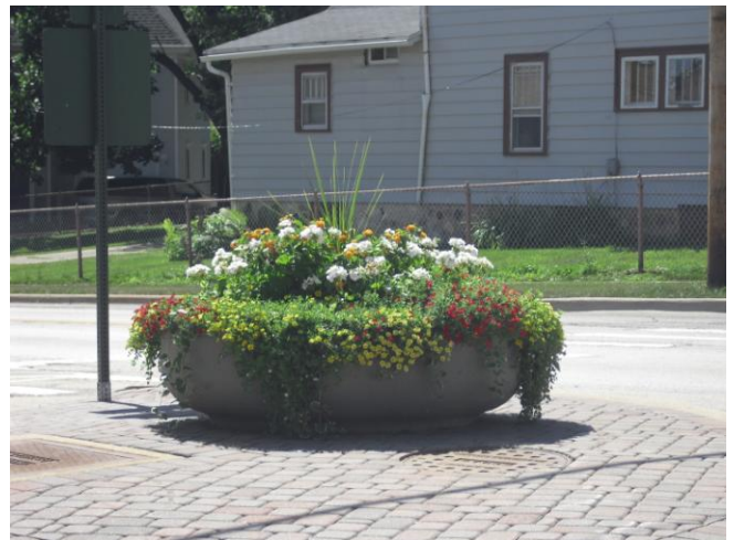
Example of decorative street fixture