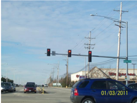
Streetscape with overhead wires