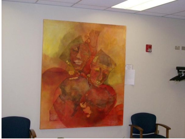
Example of indoor public art display