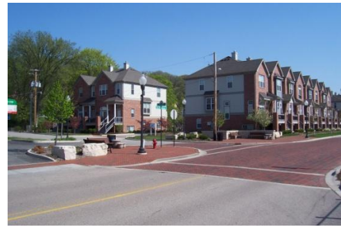
North Harrison Streetscape

within the district, following the Downtown Streetscape Enhancements Plan dated April 2008. Other areas of the Village could also benefit from creating defined streetscape themes for the various neighborhoods/districts. The streetscape themes should be carefully designed to take into account the type of movements through the area, vehicles or pedestrian, speed of travel, inviting places to stop and rest, or pass through. The scale of the elements shall be designed as appropriate.