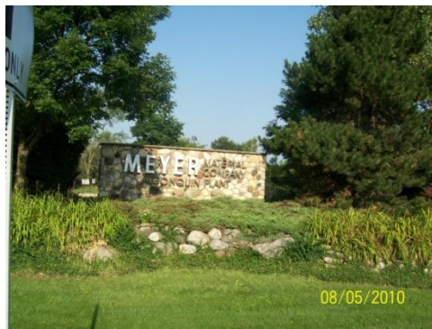
Example of entry feature elements