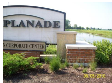
Example of entry feature elements