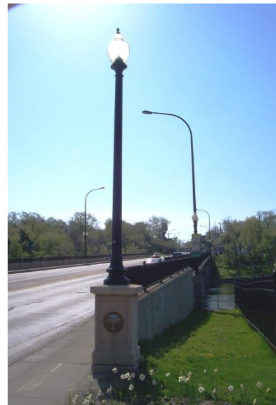
Route 62 Bridge Streetscape

The Old Town District currently has a common streetscape theme with brick paver highlights in the sidewalks, acorn lights, matching wayfinding signage, and entrance signs to define the boundary of the Old Town. As budget allows the streetscaping theme in the Old Town District should be extended to all streets