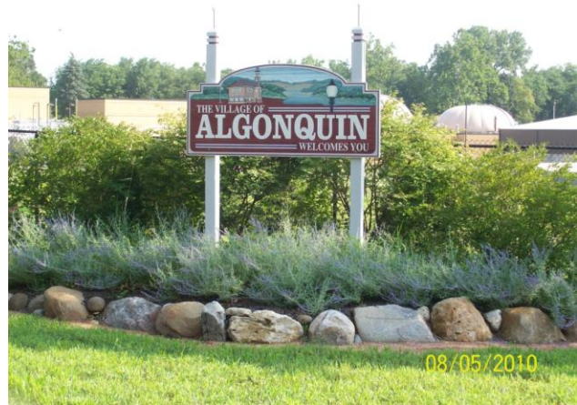
Existing Entrance on Main Street at Wastewater Treatment Facility

The Village has six main entry intersections (East Algonquin Road at Route 25; West Algonquin Road at Wentworth Drive; Main Street at Klasen Road; Main Street at Wastewater Treatment Facility; Randall Road at Algonquin Road; and Randall Road at Grandview). In order to clearly define when a person is entering the Village limits, the Village has erected free standing signs in these locations. In order to create a grand entrance these entry signs can be spruced up with additional landscaping, decorative lights, or other amenities. Other entrances into the Village that could be considered include: Square Barn Road at Huntley Road; Boyer Road at Huntley Road; Sleepy Hollow at Highmeadow Lane; Longmeadow Parkway at eastern Village boundary; Sandbloom Road at southern boundary; Lake Cook Road at Route 25; Highland Avenue at eastern boundary and entrances into the Village on the Prairie Trail Bike Path near Algonquin Road (north end) and the Fox River Trail near Souwanas Trail (south end). The boundary along Algonquin Road needs to be further identified; particularly West Algonquin Road to make it clear what areas are incorporated into Algonquin and which areas are not.