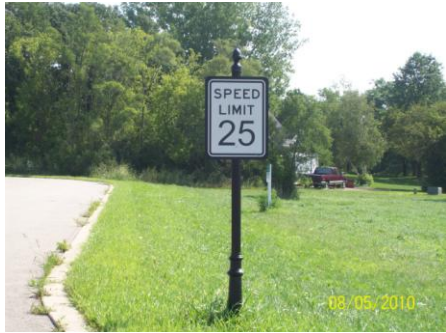
Example of decorative street sign