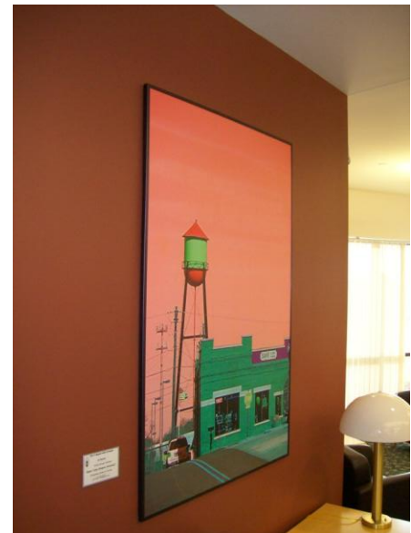
Example of indoor public art display

The Village established a Public Art Program in 2005. This program enriches the lives of all residents and visitors to the Village by exposing them to various art forms located throughout the community. Artworks are on loan to the Village for one year and displayed at public buildings and places throughout the Village. The display areas include both indoor and outdoor locations. The majority of the artwork is changed yearly. The current year display plan is available on the Village website.