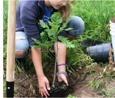
Volunteer planting an Oak tree

individual or group interested in adopting a planting area. The individual/group would be responsible for maintaining their assigned planting area for the entire year. The involvement would include keeping the area free of debris, weeds, maintaining the plants, and adding flowers. The Village would post a small sign at each area stating this area is part of the adopt-a-planting-area program and list the individual/group in charge. If an individual/group signs up to maintain an area and fails then the Village will assume responsibility for the remainder of the year or give the responsibility to another individual/group interested. That individual/group shall not be allowed to adopt a planting area for a period of 5 years. The individual/group will be responsible for all costs incurred with the planting of new materials. The Parks and Forestry department may provide assistance to individuals/groups as needed.