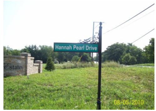
Example of decorative street sign