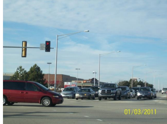
Streetscape without overhead wires