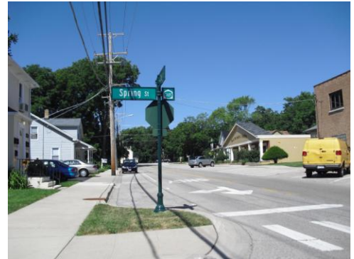
Example of back of painted street sign