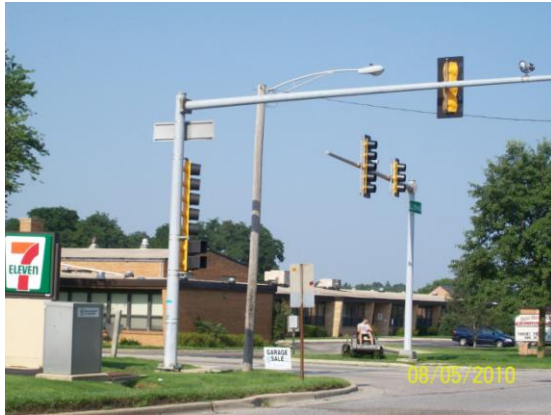
Example of unpainted poles and fixtures

Examples of unfinished (not painted) versus finished (painted) poles: