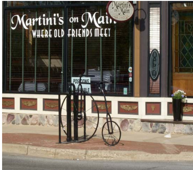
One of Algonquin's artistic bicycle racks. "The High Wheel Bike" is located downtown on Main Street.

Check out www.algonquin.org/bike to find most everything you need to know to help you Bike Algonquin!