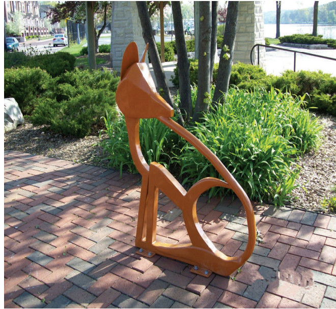
One of Algonquin's artistic bicycle racks. "The Fox" is located at Riverfront Park on North Harrison Street.

Check out www.algonquin.org/bike to find most everything you need to know to help you Bike Algonquin!