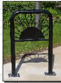
Ben Melnick "The Sun" Village Hall-Main Entrance