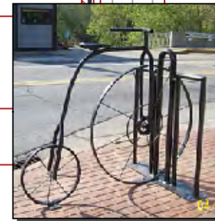
Allen Howard "The High Wheel Bike" 8 South Mains St.