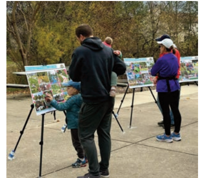
Residents participate in the Willoughby Farms Park Master Plan Open House held in November

Community input is a cornerstone of this project, and the Village is committed to ensuring the park reflects residents' priorities. The planning process began in October, with opportunities for feedback provided through a community open house, online surveys, and stakeholder interviews. Conceptual designs will be developed during December and January, and the final master plan is expected to be approved in February 2025.