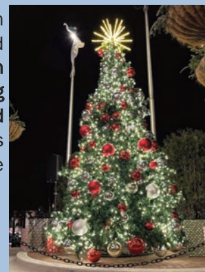
Miracle on Main Event in Old Town Algonquin

Village offices will be closed on December 24, December 25, and January 1. Groot waste collection will be delayed by one day during the weeks of December 22 and December 29. For online services or additional information, please visit www.algonquin.org .