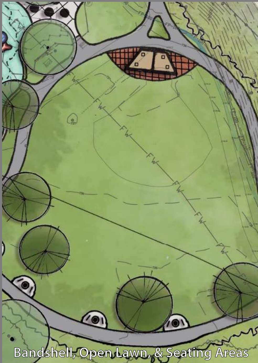
Bandshell, Open Lawn, & Seating Areas