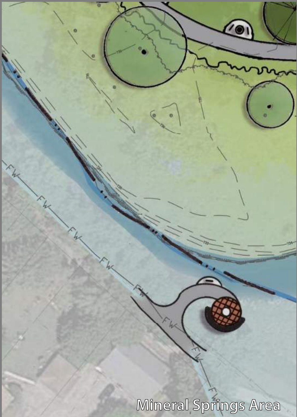
Mineral Springs Area