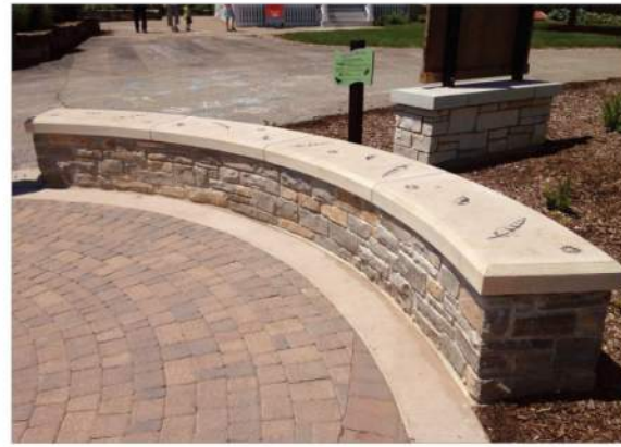
Memorial Seatwall and Pavers