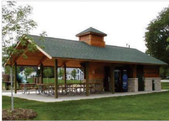
Combined Open-air Shelter and Restrooms