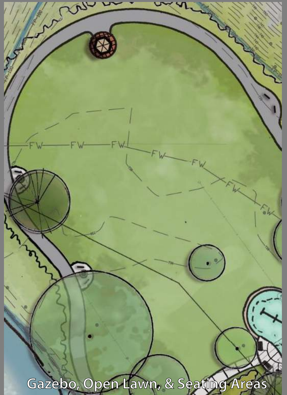
Gazebo, Open Lawn, & Seating Areas