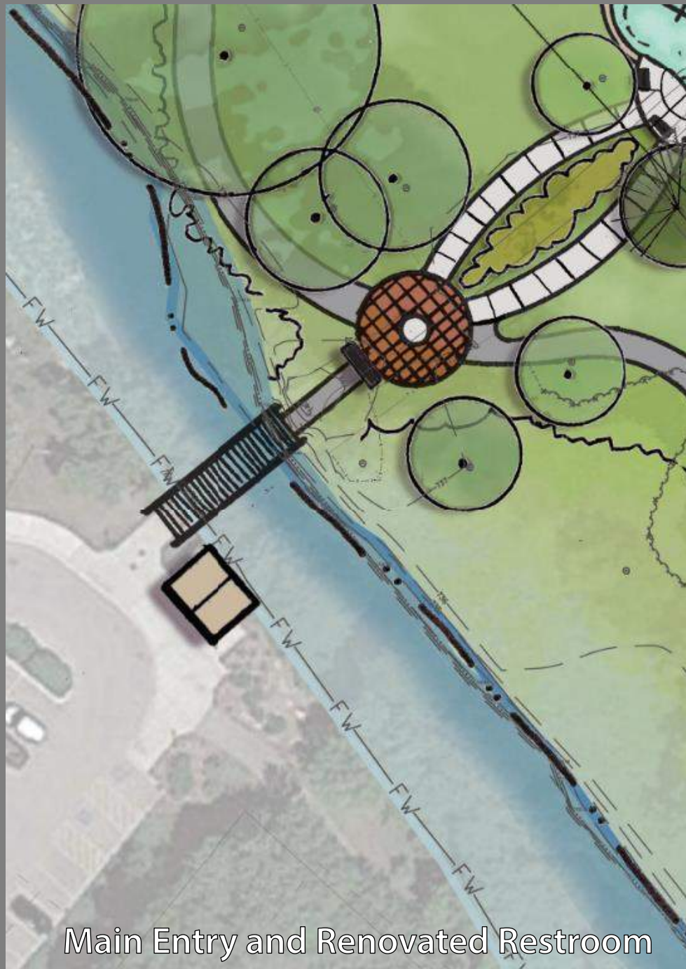
Main Entry and Renovated Restroom