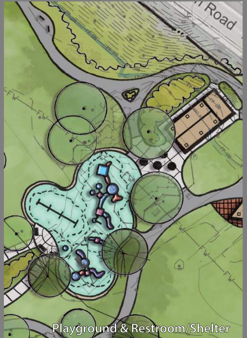
Playground & Restroom/Shelter